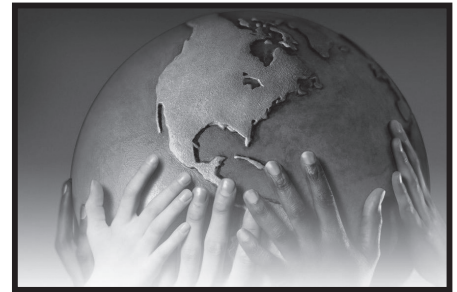
Earth Day 2010