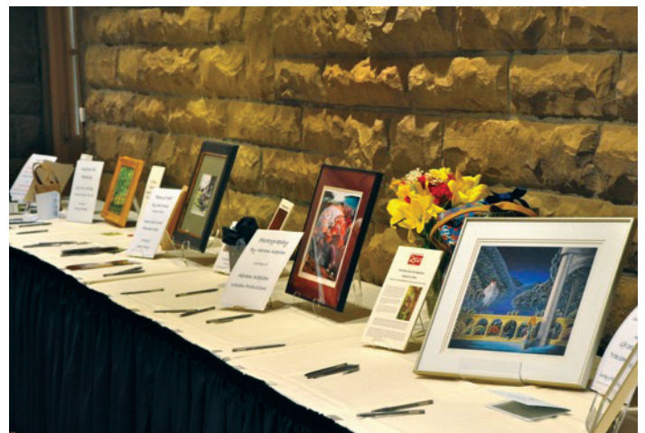
Some of the many items up for bid at the silent auction portion of the Farm to Fork event.

The Trust, with strong member support, continued its fundraising work to complete the funding of its Stewardship Fund by the end of 2020, as required by national accreditation standards of the Land Trust Alliance. Farm to Fork, the Trust's first annual local-foods tasting and silent auction held in August at the Granville Inn, was hugely successful, attended by more than 100 members and friends, and raising more than $7,500.