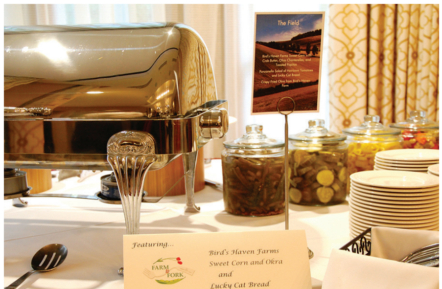
Some of the locally grown food items awaiting sampling at the Farm to Fork event.

Community outreach is a continuing effort to introduce Licking County citizens and organizations to the Trust and its initiatives. The Trust continues to offer a slideshow program that Board members are happy to present to interested groups. All interested persons or organizations are urged to contact the Trust if they would like to arrange for a general program about the Trust or for a landowner seminar.