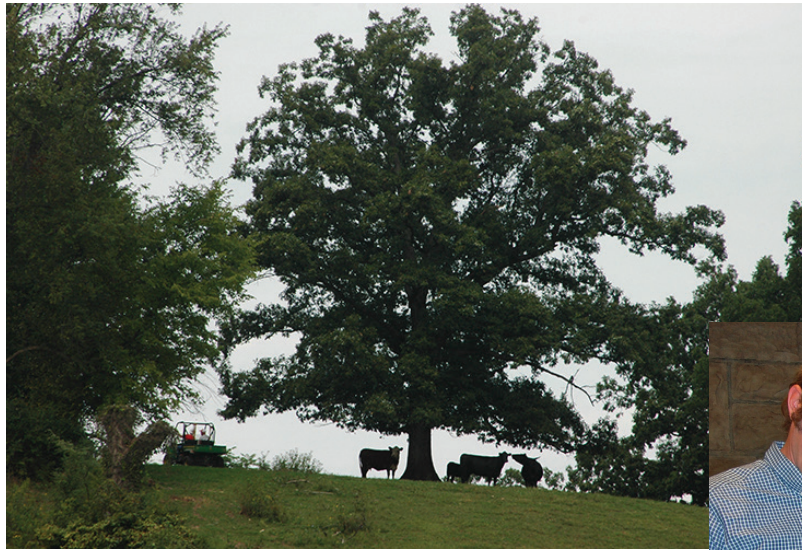
A rural vista seen by visitors to the protected Stair-Hughes Family Farm.