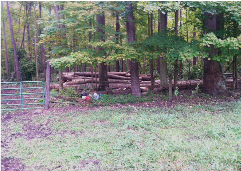
Some of the wood selectively timbered at the Fryman Reserve.

The Trust continued to widely distribute its self-published annual report and spring and fall newsletters. Over 500 copies of each were distributed to Trust members and Licking County public officials and made available at local public libraries.