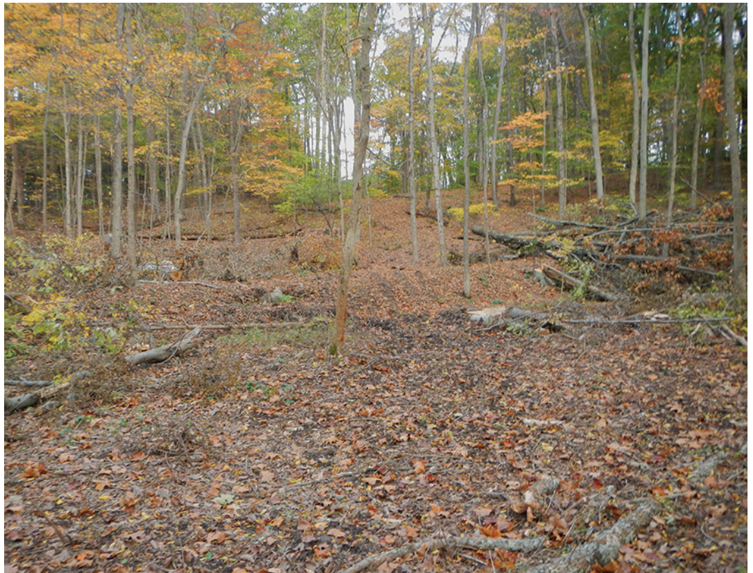
Careful and selective timbering on the Fryman Reserve allowed the property to retain its CAUV status.