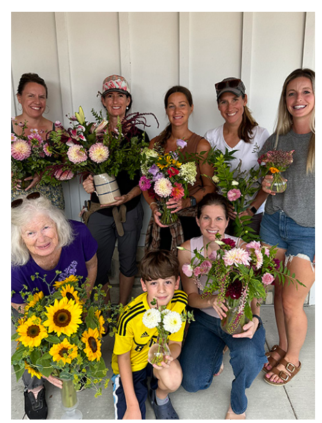
Flower arranging crew