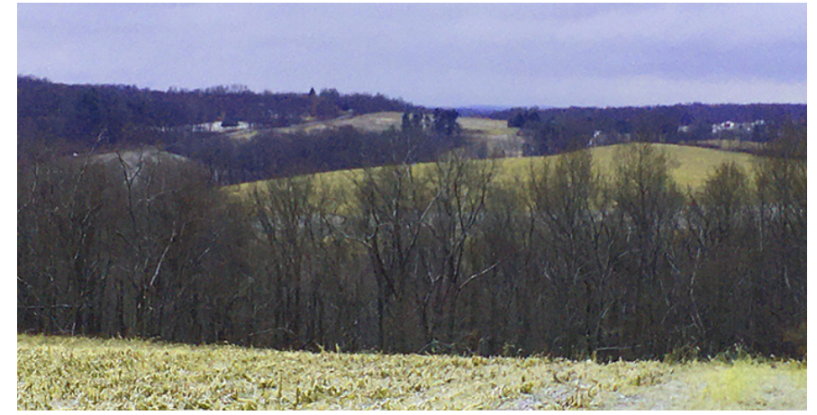
Hodgson Farm - cultivated fields interspersed with forested areas.

The 237 acre Hodgson farm is located in Fallsbury Township in the northeast corner of Licking County. The farm is nestled in rolling hills with tillable land, a nice tract of forest and a couple of streams - which are being restored with wetlands. A few years ago, landowner Christine Hodgson, and the firm, Water & Land Solutions, approached the Licking