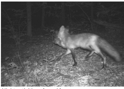
Night activities of a red fox

Social media apps such as eBird and iNaturalist facilitate sharing species sightings with a global community of amateur naturalists and professional biologists. We created a project for the LLT BioBlitz in iNaturalist to which participants could upload their photographs of