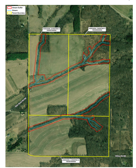
Aerial map of Hodgson Farm showing streams for watershed remediation.

mitigation bank, paying a fee to an approved in-lieu fee program, or permittee-responsible mitigation. Permittee-responsible mitigation can include wetland restoration, enhancement, or preservation.