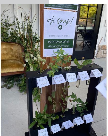
'Friend or Foe" display and photo booth